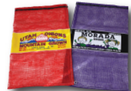
Onion / Potato Bag