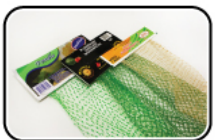
Netting (melon, cantaloupe, etc.)