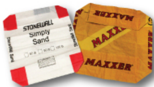
Pasted Valve Bag (cement, gravel, sand, etc.)