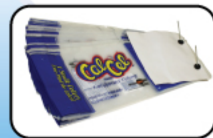
Wicket Bag (celery, lettuce, etc.)