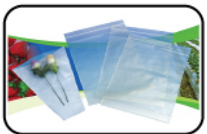
Nano Fresh Film (varies fresh vegetable & fruit)