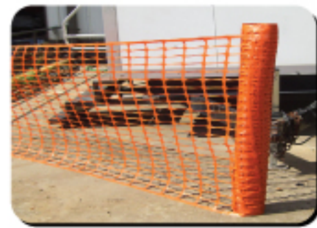
Orange Barrier Fence