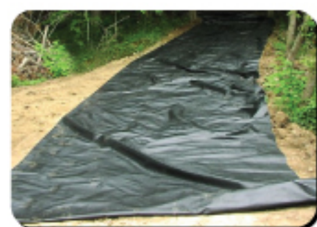
Geotextile Woven Fabric (ground cover)