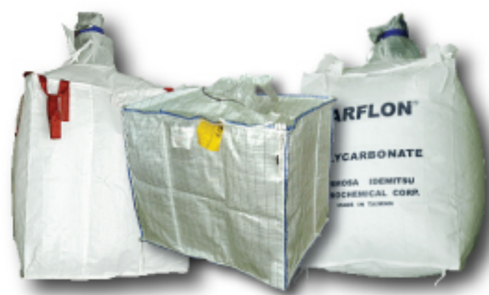
Jumbo / Bulk Bag (varies chemical resin & parts, etc.)