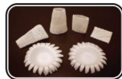
P.E. Form Sleeve (apple, pear, etc.)