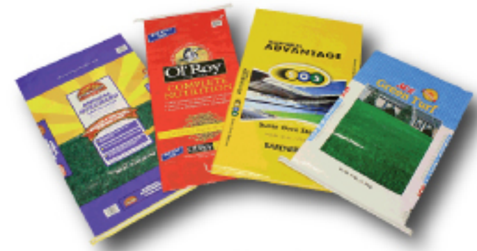
B.O.P.P. Laminated Woven Bag (varies pet food, grass seed, etc.)