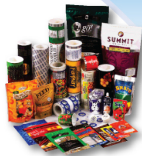
High Quality Flexible Packing Materials