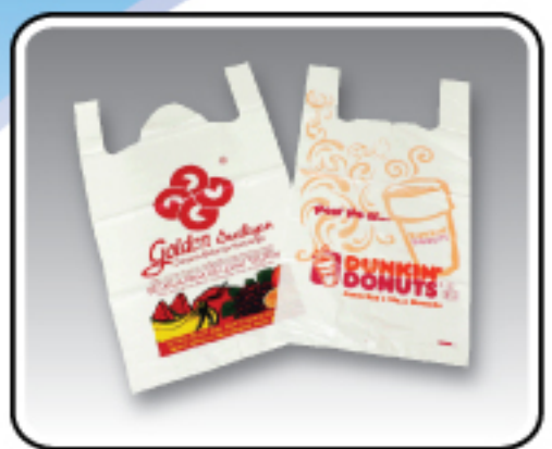
T-Shirt Bag (grocery packaging)